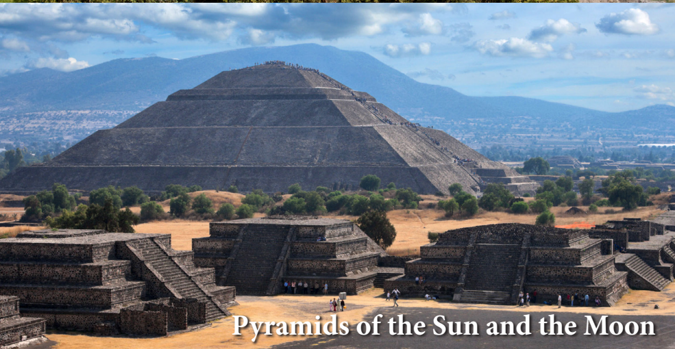
Pyramids of the Sun and the Moon