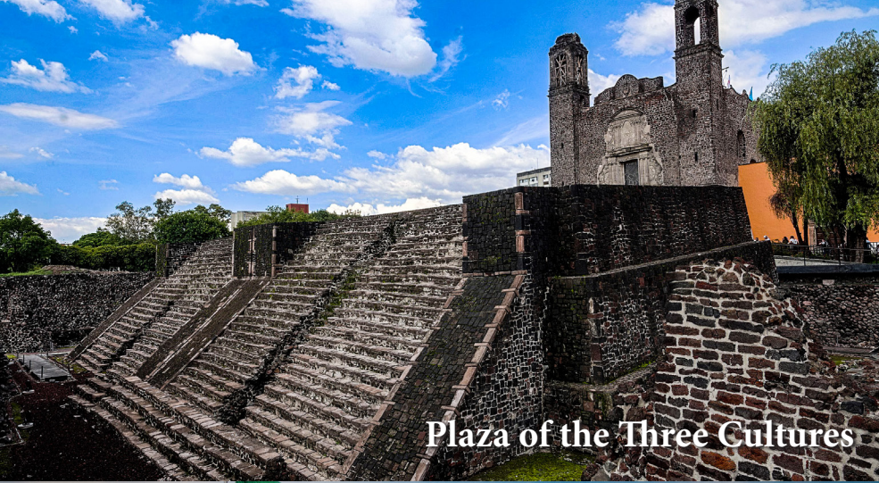
Plaza of the Three Cultures